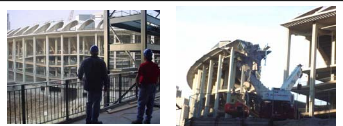
Another point of interest was the wrecking of the current Busch Stadium. A quarter of the stadium will be craned in for the new area of the infield.

ACE participants have been on two incredible field trips this year. In January, Alberici Constructors mentors invited ACE to the Marquette Building to learn about the multi-million dollar renovations to restore the building with condos, restaurants and office space. Participants walked through a model two-bedroom condo ready for a tenant. They saw the uniqueness of this building which formally housed a radio station and the tower, still mounted on the building. The developers have devised a plan to remove and possibly sell the tower to the City Museum. Upon completion, the building will have a rooftop swimming pool, a dog walk and a great view of the new Cardinal Baseball Stadium.