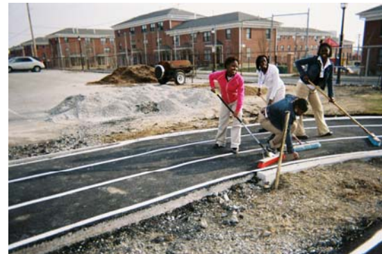
Above: Students work hard to prepare a circle track at the CCC Sports field for the newly approved track team.