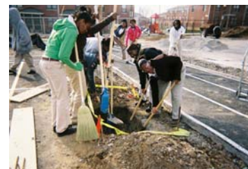
Students prepare the new track field for CCC's first ever track team.