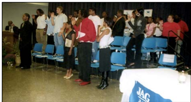
Installation of JAG officers at SLCC-Florissant Valley.