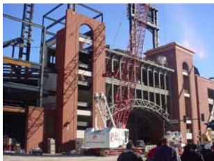
Entrance to the new stadium "under construction"

Construction Careers Center ACE participants were very privileged to get a tour of the stadium while it is still under construction and are very grateful to mentors for making this happen for their group.