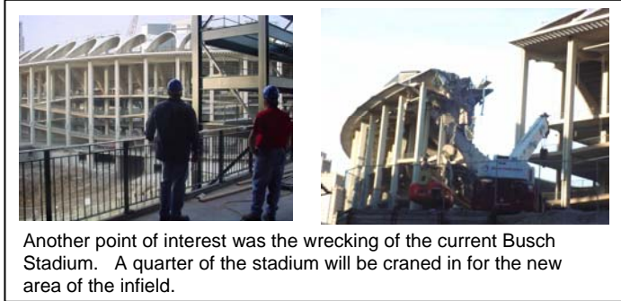
Another point of interest was the wrecking of the current Busch Stadium. A quarter of the stadium will be craned in for the new area of the infield.

safety is a very important matter in the construction industry.