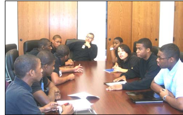
CCCP participants engaged in a group discussion.

The Construction Career Coaching Program (CCCP) is off to a good start with eleven senior participants that have committed to pursue careers in the construction industry. The students' interests range from carpentry, heating and cooling, construction business management and engineering to architecture. Participants will follow the legacies of four graduating classes pursuing careers in construction.