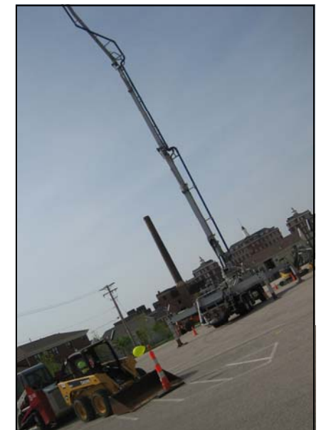
Concrete pumper donated by Concrete Strategies.